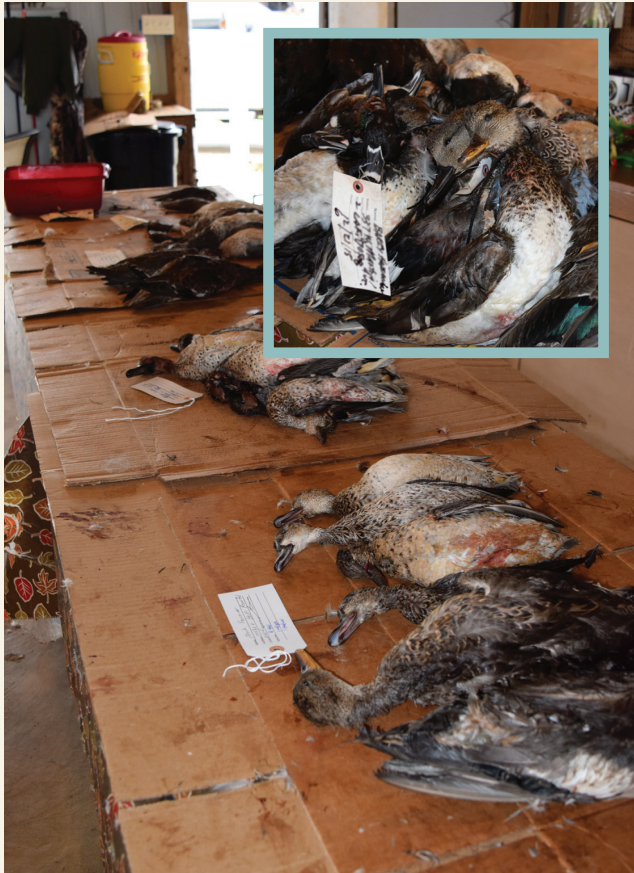
Birds must be properly tagged.